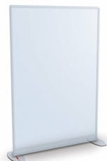
Double bolted bases are 18" long and 8 3/4" wide