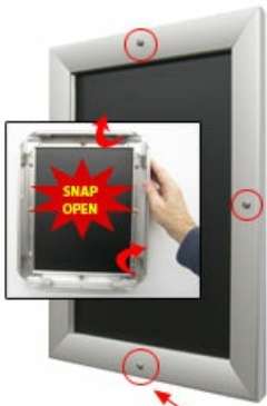
Lockable security screws placed on all 4 sides