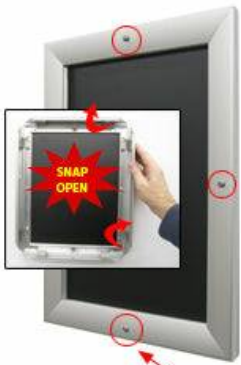
Lockable security screws placed on all 4 sides