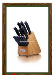
1" VIEWABLE MATBOARD