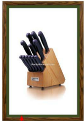
1" VIEWABLE MATBOARD