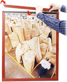
TOP or SIDE LOADING REMOVABLE CAP

FOR CURRENT PRICING, VISIT THE ID # LISTED ABOVE FREE SHIPPING