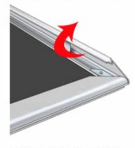
FRAME STYLE COMES IN VERTICAL OR HORIZONTAL