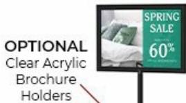
OPTIONAL Clear Acrylic Brochure Holders