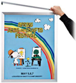
3/4" SLIM DESIGN

FOR CURRENT PRICING, VISIT THE ID # LISTED ABOVE FREE SHIPPING