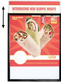
5/8" SLIM DESIGN

FOR CURRENT PRICING, VISIT THE ID # LISTED ABOVE FREE SHIPPING