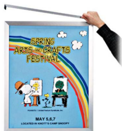
3/4" SLIM DESIGN

- High Impact acrylic, perfect for high traffic or public environments