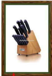
1" VIEWABLE MATBOARD

FOR CURRENT PRICING, VISIT THE ID # LISTED ABOVE