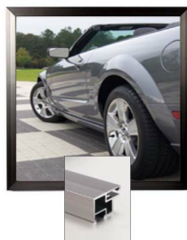
SWING OPEN & SWING CLOSE

FOR CURRENT PRICING, VISIT THE ID # LISTED ABOVE