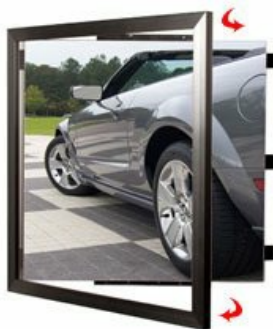
EASY POSTER CHANGES