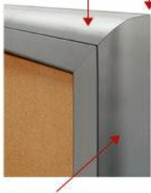
RADIUS EDGES on ALL 4 Sides Sleek and Contemporary Design