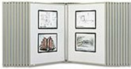
SWINGING PANELS FLIP OPEN LIKE A BOOK