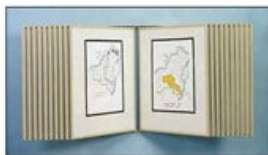
BEIGE FRAME FINISH WITH WHITE PANEL DIVIDER