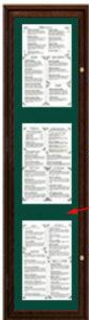
2 Security Cam Lcoks (Shown with Dark Spruce)