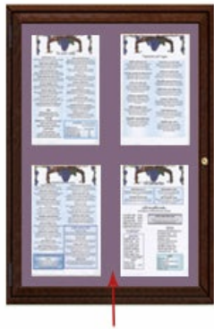
10 Different Fabric Colors to Choose From (Shown is Amethyst Fabric )